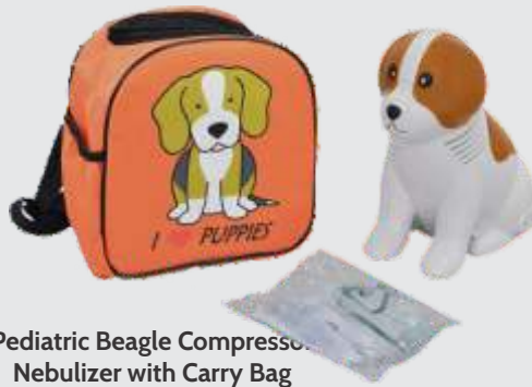
Pediatric Beagle Compressor Nebulizer with Carry Bag