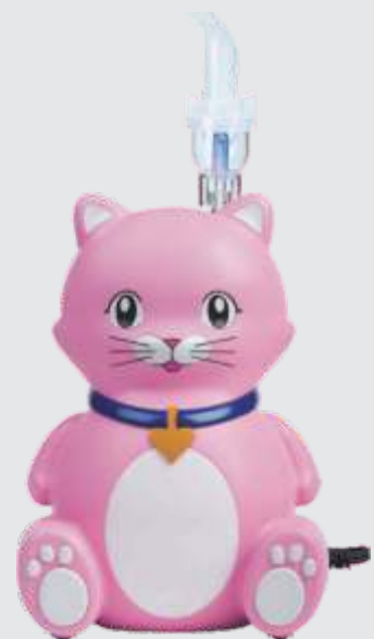
Veridian Claw-dia Kitty Compressor Nebulizer Kit