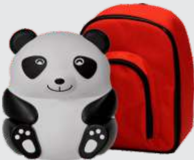
Mq6003 "Panda Style" Pediatric Nebulizer

The Vios Aerosol Delivery System is designed from PARI's long legacy of clinically proven products and consists of two important components: a Vios compressor and a PARI nebulizer. Vios was inspired by the Latin and Greek words for "Life" and our goal is to improve quality of "Life" and patient lifestyle through efficient aerosol delivery. The Vios delivers consistent particle size and fast treatments resulting in targeted delivery to the lungs.