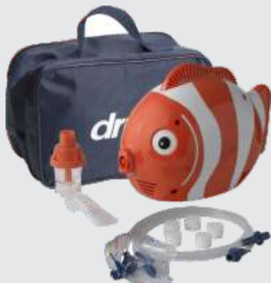
Fish Pediatric Compressor Nebulizer