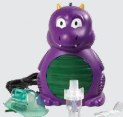
Dexter Dragon Pediatric Compressor Nebulizer Kit